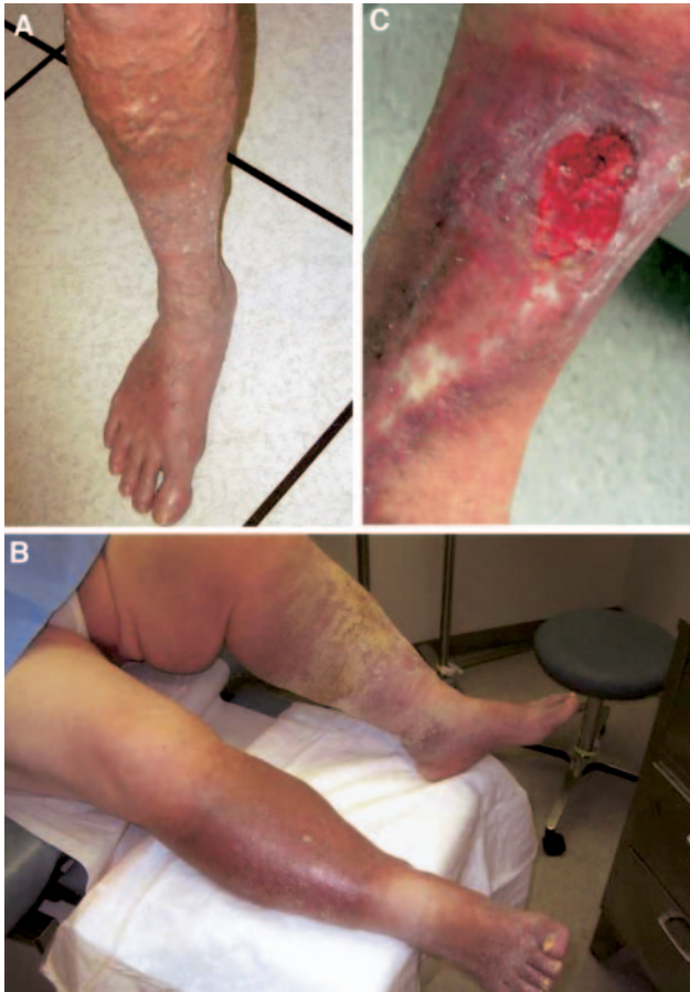
Figure 2. Manifestations of CVI. A, Uncomplicated varicose veins. B, Hyperpigmentation, dermatitis, and severe edema likely resulting from combined lymphedema. C, Active and healed venous ulcerations.

or absence of symptoms. The etiologic classification is based on congenital, primary, and secondary causes of venous dysfunction. Congenital disorders are those that are present at birth, although they may be recognized later in life, including the well-recognized Klippel-Trenaunay (varicosities and venous malformations, capillary malformation, and limb hypertrophy) and Parkes-Weber (venous and lymphatic malformations, capillary malformations, and arteriovenous fistulas) syndromes. 27 The cause of primary venous insufficiency is uncertain, whereas secondary venous insufficiency is the result of an acquired condition. The anatomic classification describes the superficial, deep, and perforating venous systems, with multiple venous segments that may be involved. The pathophysiological classification describes the underlying mechanism resulting in CVI, including reflux, venous obstruction, or both. Validation of the CEAP classification system has often focused on the clinical classification. 28 The classification is a valuable tool in the objective evaluation of CVI, providing a system to standardize CVI classification, with emphasis on the manifestations, cause, and distribution of the venous disease that is widely accepted. 29